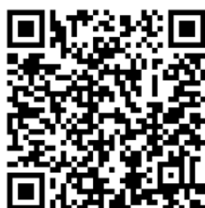
4. Book of Ayurvedic