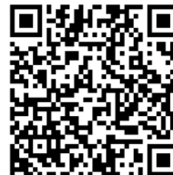
3. A History of Pharmacy in Picture