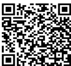
7. T/B of Pharmacognosy & Phytochemistry