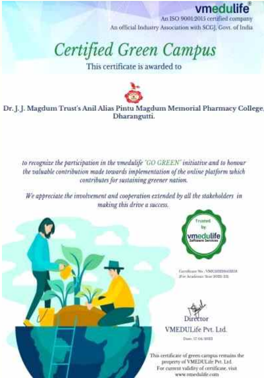
Institute awarded Green campus for academic Year 2022-2023