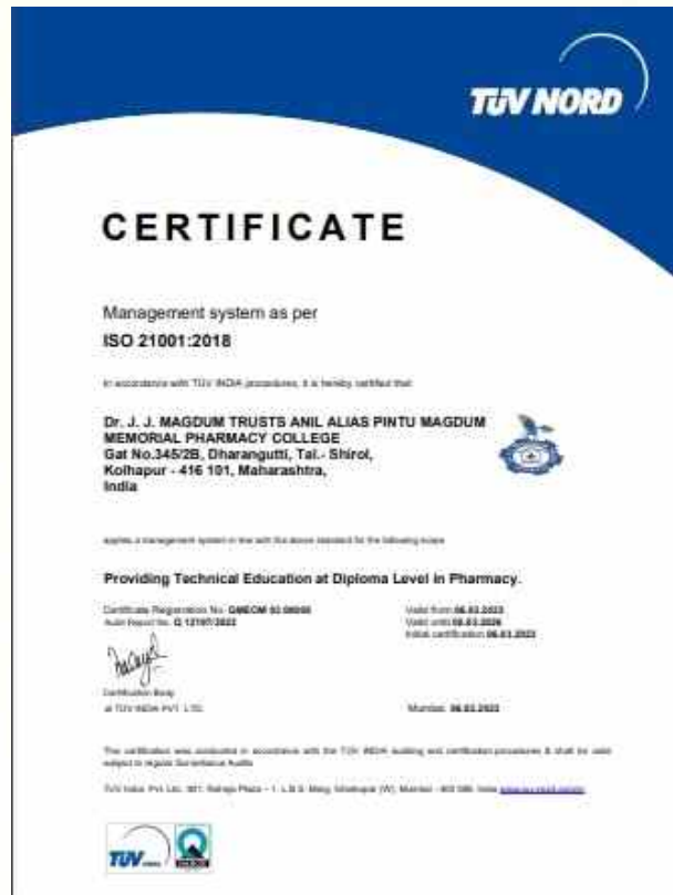
Institute awarded ISO Certified