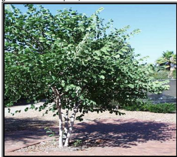
Fig. 1- Bauhinia variegata Linn. Plant

coriaceous, deeply cordate with two leaflets, connate for about two-thirds up, leaflets are ovate, rounded at apex, 10-15cm long, adult beneath when young. Its young stem Flowers are variously coloured, in few-flowered, lateral, sessile or short peduncle corymbs, the uppermost petal darker and variegated usually appearing before the leaves in short axillary or terminal racemes, stamens 5, staminodes absent, fruits flat; hard glabrous dehiscent pods, 10-15 seeded.