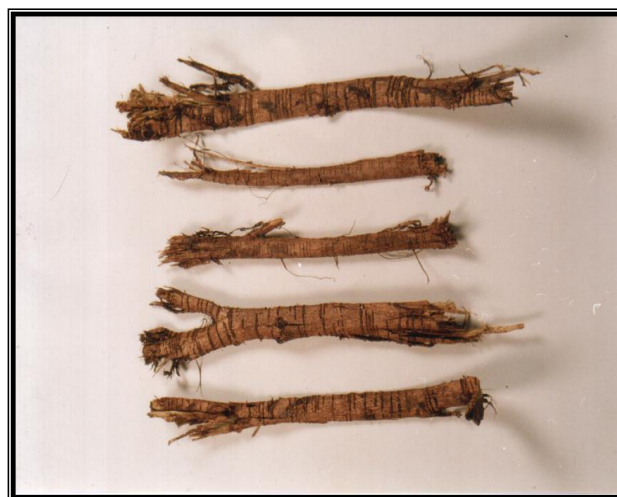
Fig. 2-Roots of Bauhinia variegata Linn Plant