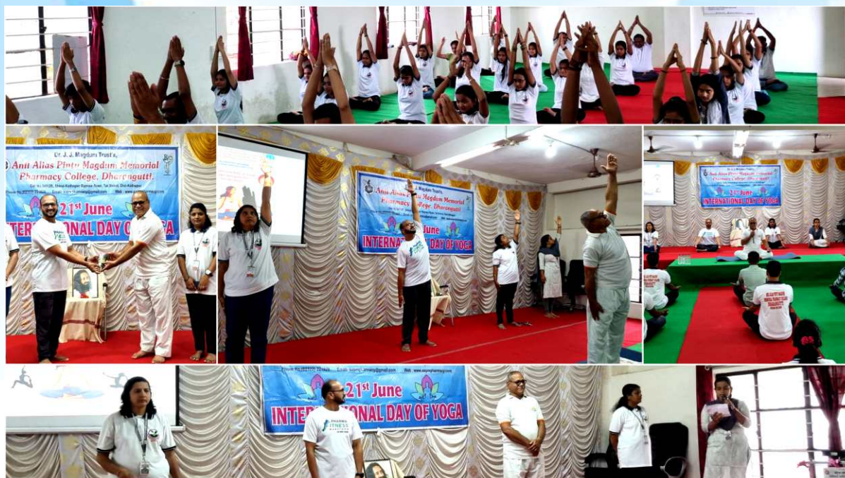
NSS Unit Program No.1 Celebration of International Day of Yoga on 21.06.2025