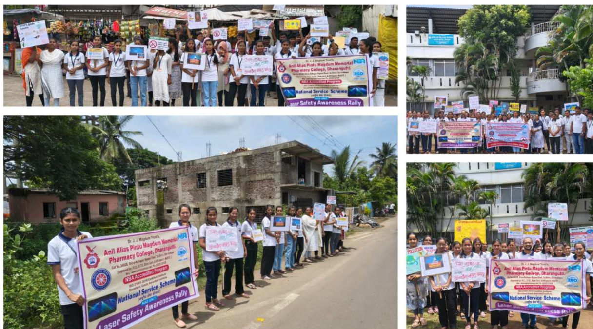
NSS Unit Program No.3 Laser Safety Awareness Rally was Conducted on 22.08.2025