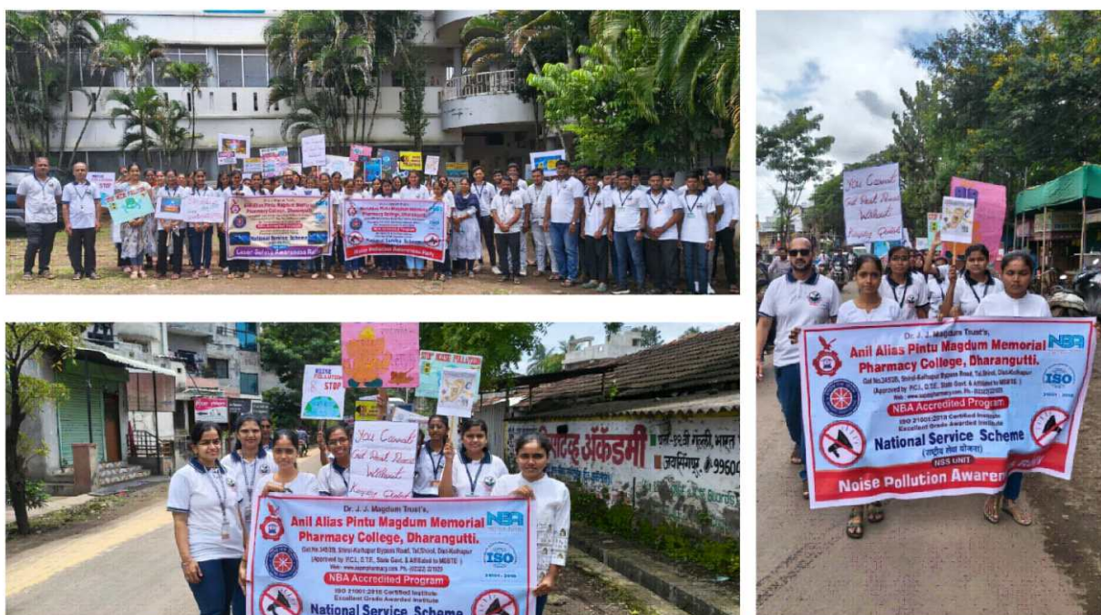
NSS Unit Program No.2 Noise Pollution Awareness Rally was Conducted on 22.08.2025